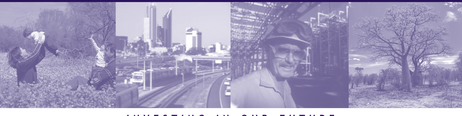
INVESTING IN OUR FUTURE